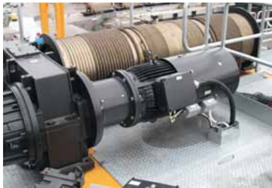
Service modularity for quick and less frequent maintenance (direct gantry and trolley drives, flange-mounted motors).

Konecranes has a worldwide parts network. Spare parts are available for at least 10 years. All key components come from industry-leading suppliers.